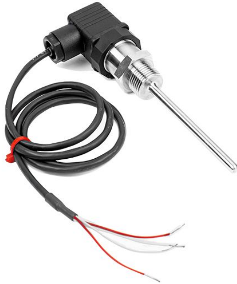
'HIRSCHMANN PT100 PROBE ASSEMBLY'