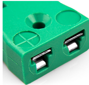
Miniature in-line Socket - Quick Wire (dimensions in mm)

Labfacility are the UK's leading manufacturer of Temperature Sensors, Thermocouple Connectors and associated Temperature Instrumentation and stockings of Thermocouple Cables. The Company has been trading since 1971 and is ISO9001 accredited.