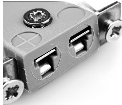
Miniature Socket -

Quick Wire with stainless steel mounting bracket