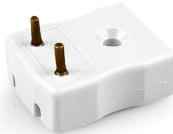
Miniature PCB Socket (dimensions in mm)