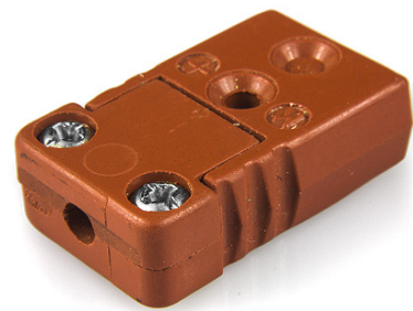
Miniature Hi-Temp Plastic in-line Socket - HTP (dimensions in mm)

Labfacility are the UK's leading manufacturer of Temperature Sensors, Thermocouple Connectors and associated Temperature Instrumentation and stockings of Thermocouple Cables. The Company has been trading since 1971 and is ISO9001 accredited.