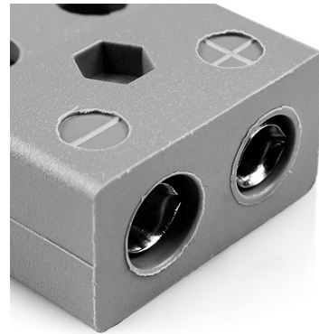
Standard in-line Socket - Quick Wire (dimensions in mm)

Labfacility are the UK's leading manufacturer of Temperature Sensors, Thermocouple Connectors and associated Temperature Instrumentation and stockings of Thermocouple Cables. The Company has been trading since 1971 and is ISO9001 accredited.