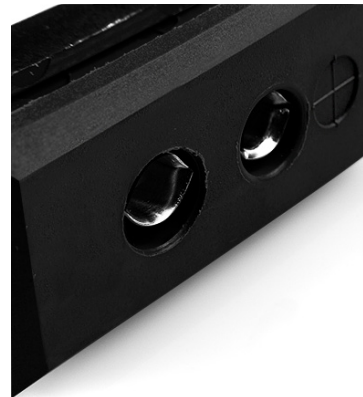
Standard Fascia Socket (with nylon mounting clip) (dimensions in mm)

Labfacility are the UK's leading manufacturer of Temperature Sensors, Thermocouple Connectors and associated Temperature Instrumentation and stockings of Thermocouple Cables. The Company has been trading since 1971 and is ISO9001 accredited.