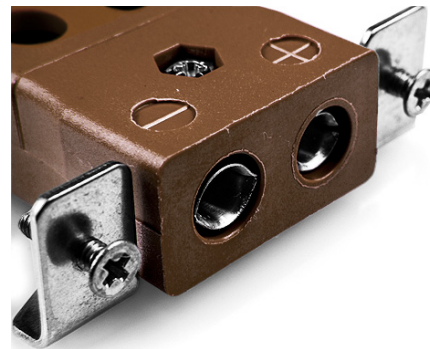
Standard Socket - Quick Wire with stainless steel mounting bracket (dimensions in mm)

Labfacility are the UK's leading manufacturer of Temperature Sensors, Thermocouple Connectors and associated Temperature Instrumentation and stockings of Thermocouple Cables. The Company has been trading since 1971 and is ISO9001 accredited.