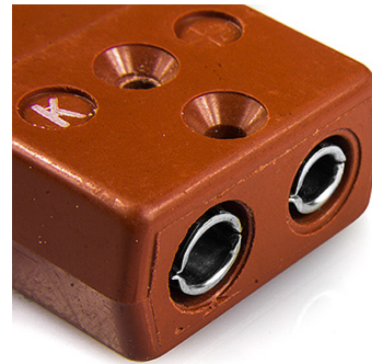
Standard Hi-Temp Plastic in-line Socket - HTP (dimensions in mm)

Labfacility are the UK's leading manufacturer of Temperature Sensors, Thermocouple Connectors and associated Temperature Instrumentation and stockings of Thermocouple Cables. The Company has been trading since 1971 and is ISO9001 accredited.