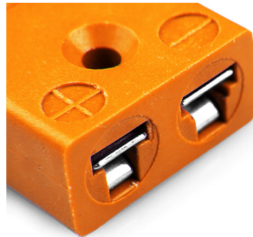
Miniature in-line Socket (dimensions in mm)

Labfacility are the UK's leading manufacturer of Temperature Sensors, Thermocouple Connectors and associated Temperature Instrumentation and stockings of Thermocouple Cables. The Company has been trading since 1971 and is ISO9001 accredited.