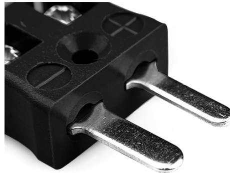
Miniature in-line Plug - Quick Wire (dimensions in mm)

Labfacility are the UK's leading manufacturer of Temperature Sensors, Thermocouple Connectors and associated Temperature Instrumentation and stockings of Thermocouple Cables. The Company has been trading since 1971 and is ISO9001 accredited.