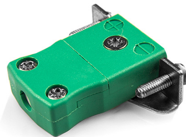
Miniature in-line Socket with stainless steel mounting bracket (dimensions in mm)

Labfacility are the UK's leading manufacturer of Temperature Sensors, Thermocouple Connectors and associated Temperature Instrumentation and stockings of Thermocouple Cables. The Company has been trading since 1971 and is ISO9001 accredited.