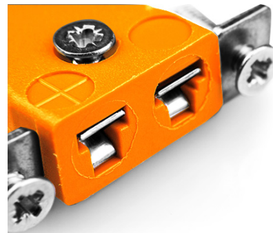
Miniature Socket -