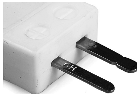
Miniature Hi-Temp Ceramic in-line Plug - HTC (dimensions in mm)

Labfacility are the UK's leading manufacturer of Temperature Sensors, Thermocouple Connectors and associated Temperature Instrumentation and stockings of Thermocouple Cables. The Company has been trading since 1971 and is ISO9001 accredited.