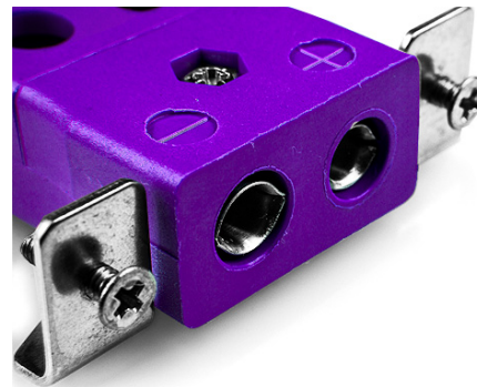
Standard Socket - Quick Wire with stainless steel mounting bracket (dimensions in mm)

Labfacility are the UK's leading manufacturer of Temperature Sensors, Thermocouple Connectors and associated Temperature Instrumentation and stockings of Thermocouple Cables. The Company has been trading since 1971 and is ISO9001 accredited.