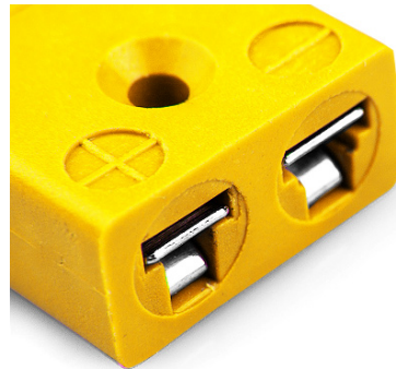
Miniature in-line Socket (dimensions in mm)

Labfacility are the UK's leading manufacturer of Temperature Sensors, Thermocouple Connectors and associated Temperature Instrumentation and stockings of Thermocouple Cables. The Company has been trading since 1971 and is ISO9001 accredited.