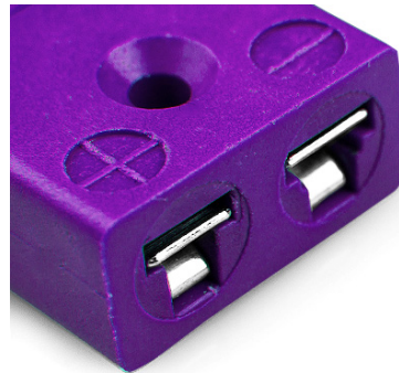
Miniature in-line Socket (dimensions in mm)

Labfacility are the UK's leading manufacturer of Temperature Sensors, Thermocouple Connectors and associated Temperature Instrumentation and stockings of Thermocouple Cables. The Company has been trading since 1971 and is ISO9001 accredited.