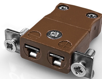
Miniature in-line Socket with stainless steel mounting bracket (dimensions in mm)

Labfacility are the UK's leading manufacturer of Temperature Sensors, Thermocouple Connectors and associated Temperature Instrumentation and stockings of Thermocouple Cables. The Company has been trading since 1971 and is ISO9001 accredited.