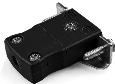
Miniature in-line Socket with stainless steel mounting bracket (dimensions in mm)

Labfacility are the UK's leading manufacturer of Temperature Sensors, Thermocouple Connectors and associated Temperature Instrumentation and stockings of Thermocouple Cables. The Company has been trading since 1971 and is ISO9001 accredited.