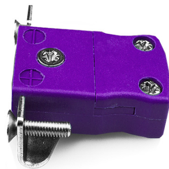
Miniature in-line Socket with stainless steel mounting bracket (dimensions in mm)

Labfacility are the UK's leading manufacturer of Temperature Sensors, Thermocouple Connectors and associated Temperature Instrumentation and stockings of Thermocouple Cables. The Company has been trading since 1971 and is ISO9001 accredited.