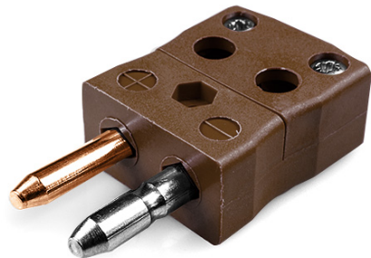
Standard in-line Plug - Quick Wire (dimensions in mm)

Labfacility are the UK's leading manufacturer of Temperature Sensors, Thermocouple Connectors and associated Temperature Instrumentation and stockings of Thermocouple Cables. The Company has been trading since 1971 and is ISO9001 accredited.