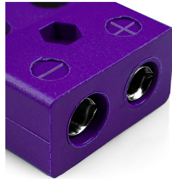
Standard in-line Socket - Quick Wire (dimensions in mm)

Labfacility are the UK's leading manufacturer of Temperature Sensors, Thermocouple Connectors and associated Temperature Instrumentation and stockings of Thermocouple Cables. The Company has been trading since 1971 and is ISO9001 accredited.