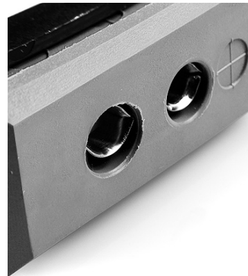
Standard Fascia Socket (with nylon mounting clip) (dimensions in mm)

Labfacility are the UK's leading manufacturer of Temperature Sensors, Thermocouple Connectors and associated Temperature Instrumentation and stockings of Thermocouple Cables. The Company has been trading since 1971 and is ISO9001 accredited.